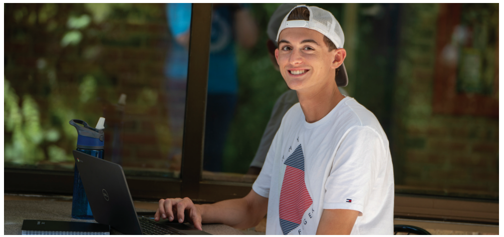
Student in courtyard at Texas Township Campus

The Summer 2022 semester at Kalamazoo Valley Community College starts on May 9. Registration opens on Monday, March 7 and the college welcomes guest students to apply.