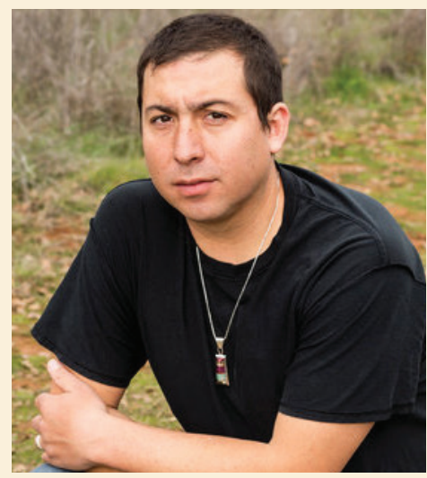
Visiting Writer Tommy Orange

Kalamazoo Valley Community College's "About Writing" Visiting Writers Series welcomes Tommy Orange on April 19 for two events: an on-stage conversation at 10 a.m. and a reading and on-stage conversation at 2:15 p.m. in the Student Commons Theater, Room 4240, at the Texas